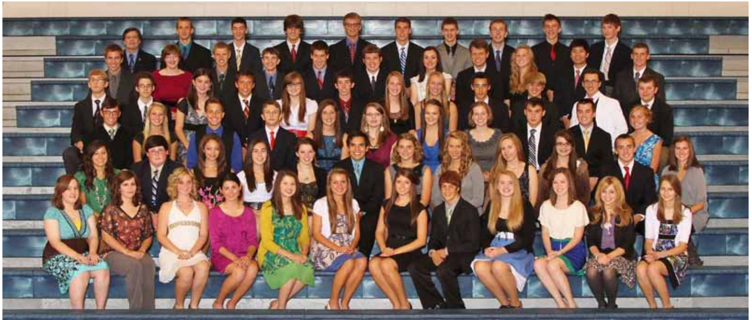
Marian Central 2011 National Honor Society members pictured